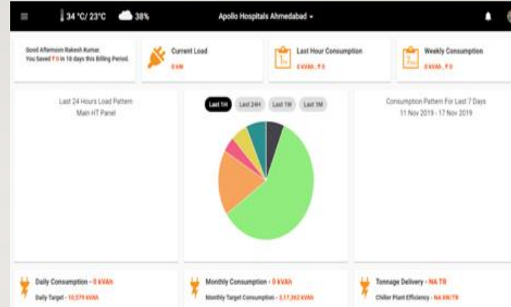
Online Data Management