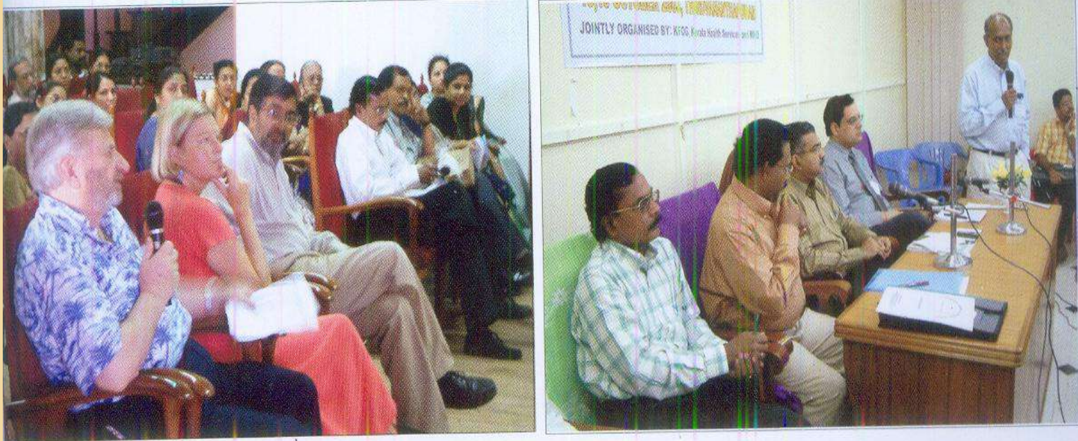
Participants of the workshop at Thiruvananthapuram that started off the CRMD