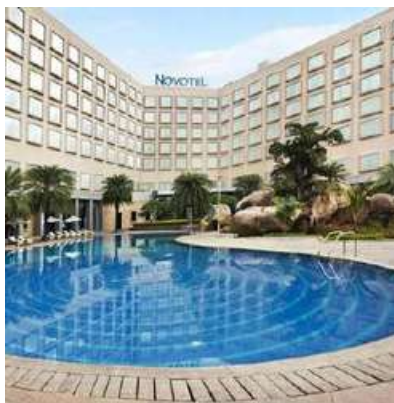
15TH & 16TH APRIL AT NOVOTEL CONVENTION CENTRE