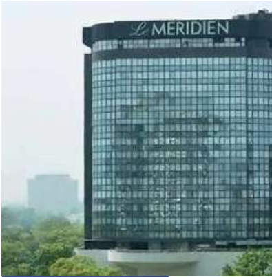
24TH & 25TH APRIL AT LE MERIDIEN