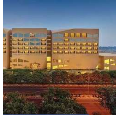
14TH & 15TH APRIL AT TAJ VIVANTA