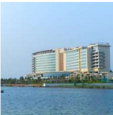
18TH & 19TH APRIL AT GRAND HYATT