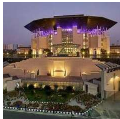
6TH & 7TH APRIL AT BISWA BANGLA CENTRE