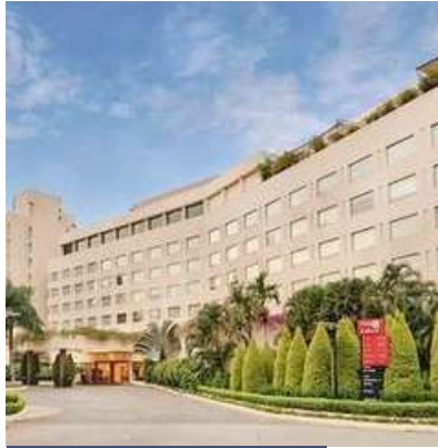
19TH & 20TH MARCH AT THE LALIT ASHOK