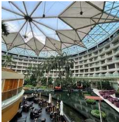
13TH & 14TH APRIL AT SAHARA STAR HOTEL