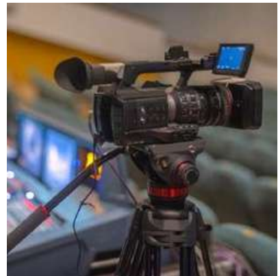
CXO ROUNDTABLES & WEBINARS