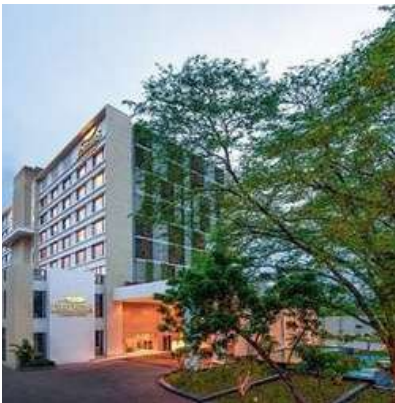
6TH & 7TH APRIL AT HOTEL FEATHERS